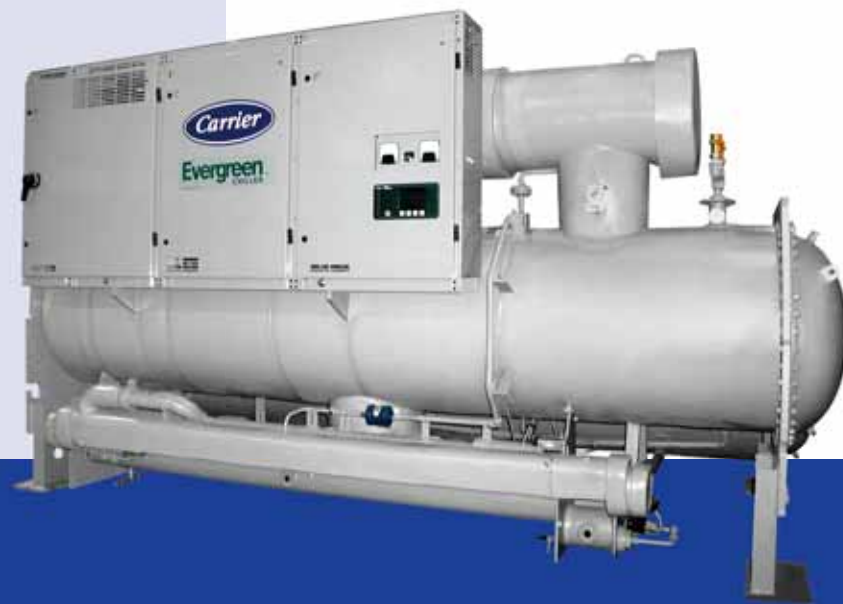
23XRV ■ HFC-134a ■ 300 to 550 tons

As with all of Carrier's Evergreen family of chillers, the 23XRV enables chiller plants to achieve superior efficiencies at true operating conditions without compromising the environment. With environmentally sound refrigerant, superior efficiency, and powerful controls, these units are ideal for both new construction and replacement projects.